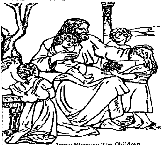
Jesus Blessing The Children